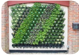
Funding application for living walls