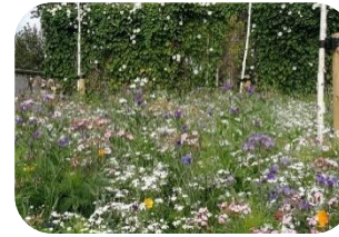
Green spaces & wildflowers