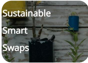
Sustainable Smart Swaps