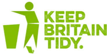
Exploring ways to reduce waste