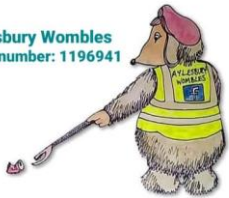
Supporting the Aylesbury Wombles

Aylesbury Wombles charity number: 1196941