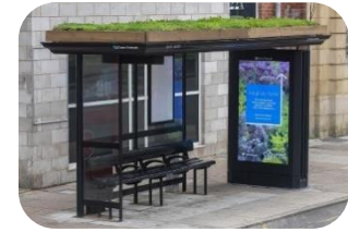
Bee Bus Stops and urban hanging baskets

Aylesbury Wombles charity number: 1196941