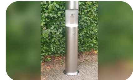
Water refill stations/shops offering refills